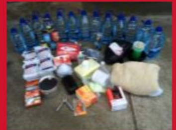
En la escuela

Vernon Elementary School 2044 NE Killingsworth, Portland, OR 97211