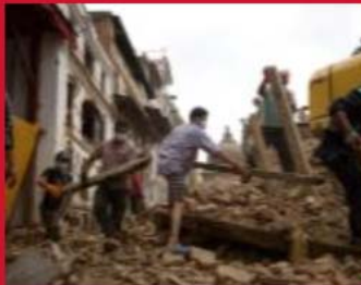
En la comunidad